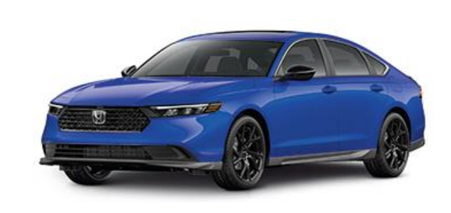
Aero Kit - Touring Trim $ 2,826.00 $12.89 /wk * (6.99%)

Genuine Honda Accessories purchased with a new Honda vehicle include a 3 year / 60,000 km manufacturer's warranty. Vehicle accessories purchased after vehicle sale include a 1 year / 20,000km manufacturer's warranty. *Prices shown include the cost of installation.