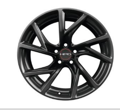
19" HPD Alloy Wheels, Black $ 3,589.60 $16.37 /wk * (6.99%)