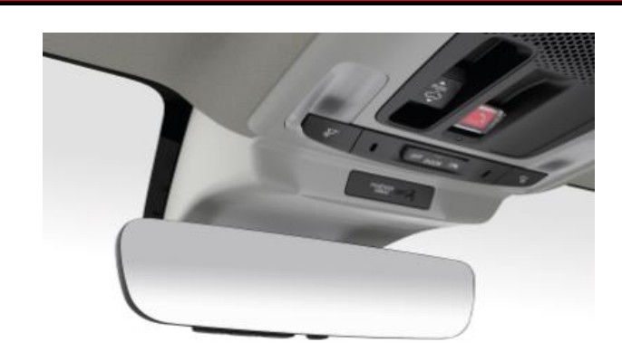
Auto Day/Night Mirror with Home Link $ 631.80 $2.88 /wk * (6.99%)