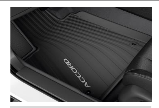
All Season Floor Mats $ 277.60 $1.27 /wk * (6.99%)