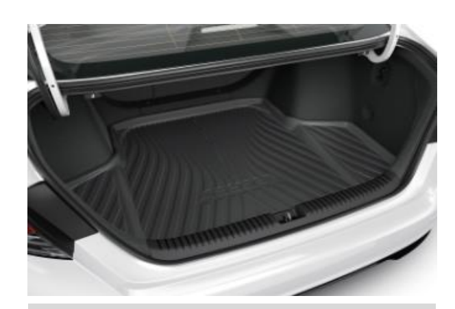
Trunk Tray $ 197.60 $0.90 /wk* (6.99%)