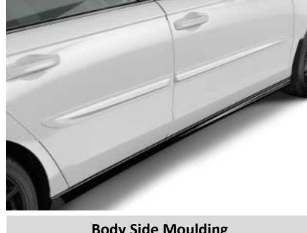
$ 400.40 $1.83 /wk * (6.99%)