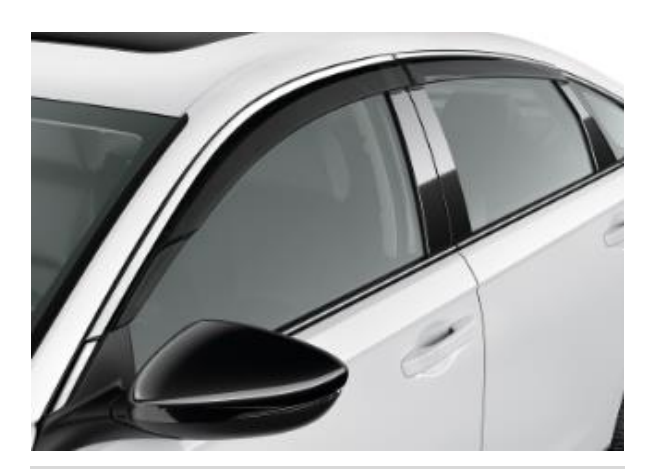
Door Visor $ 368.00 $1.68 /wk * (6.99%)