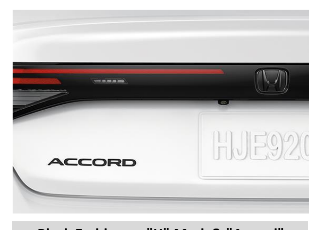
$ 185.00 $0.84 /wk * (6.99%)