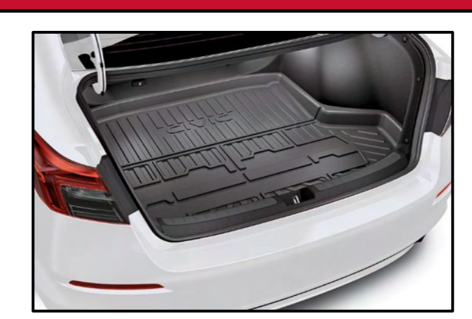
Trunk Tray $ 191 $0.87 /wk * (6.99%)