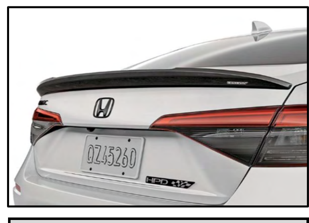
Decklid Spoiler $ 537 $2.45 /wk * (6.99%)