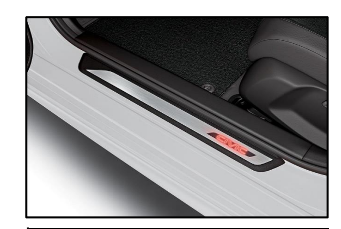
| Illuminated Door Sill Trim | $ 547 $2.49 /wk * (6.99%)