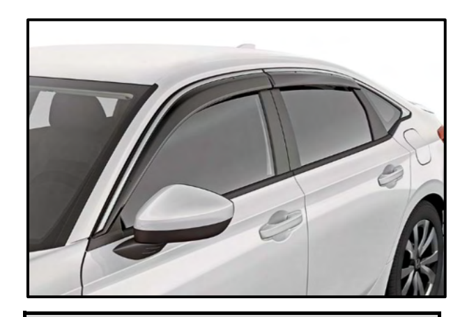
$ 378 $1.72 /wk * (6.99%)