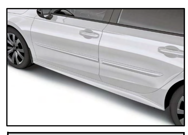
Body Side Molding $ 377 $1.72 /wk* (6.99%)