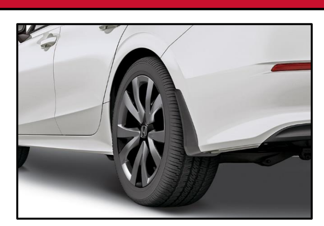
Splash Guards - Rear $ 152 $0.69 /wk * (6.99%)