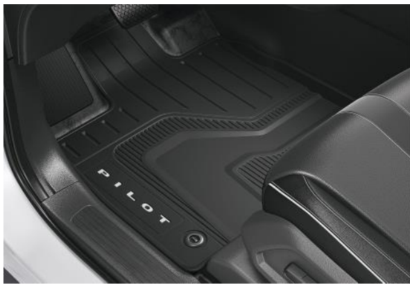
All Season Floor Mats