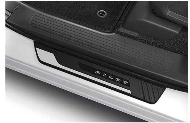
Illuminated Door Sill