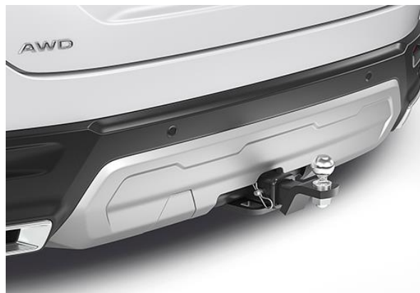
**Towing Package - Touring Trim