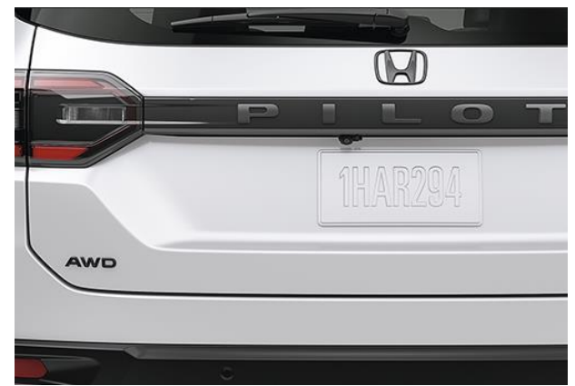
Black Emblems - "H" Mark & AWD