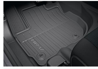
All Season Floor Mats $ 261.00 $1.08 /wk * (2.99%)