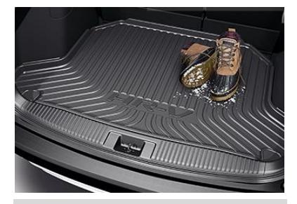
Cargo Tray $ 179.00 $0.74 /wk * (2.99%)