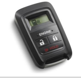
Remote Engine Starter $ 927.00 $3.84 /wk * (2.99%)