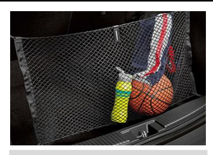
Cargo Net $ 119.00 $0.49 /wk * (2.99%)