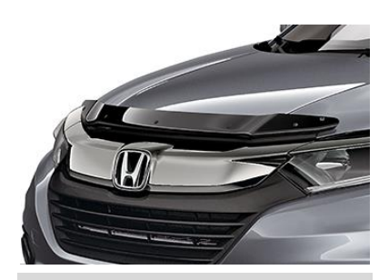
Hood Edge Deflector $ 298.00 $1.23 /wk * (2.99%)