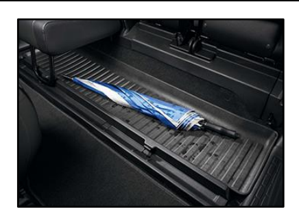
Cargo Tray - In-Cabin $ 89.60 $0.37 /wk * (2.99%)