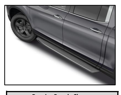
Running Board - Chrome $ 905.40 $3.75 /wk* (2.99%)