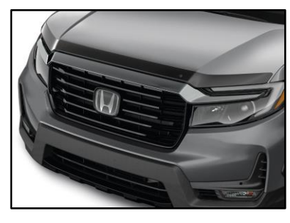
Hood Protector $ 350.60 $1.45 /wk* (2.99%)