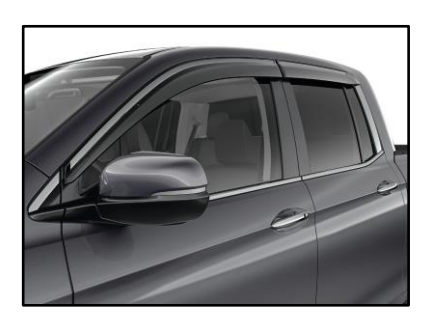
Door Visors $ 356.40 $1.48 /wk* (2.99%)