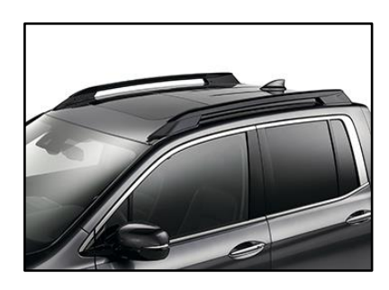
Roof Rack Rails - Black or Silver $ 789.40 $3.27 /wk * (2.99%)