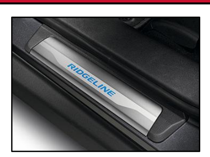
Illuminated Door Sill Trim - Blue or Red 5 625.60 $2.59 /wk * (2.99%)