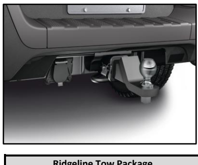
Ridgeline Tow Package 5 235.60 $0.98 /wk * (2.99%)