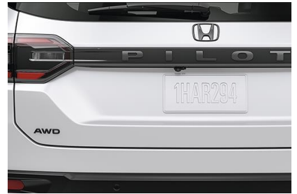
Black Emblems - "H" Mark & AWD