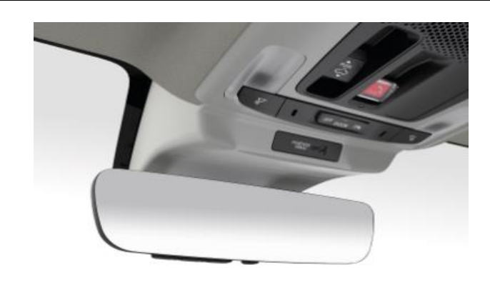
Auto Day/Night Mirror with Home Link $ 631.80 $2.88 /wk * (6.99%)