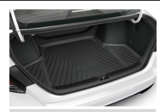
Trunk Tray $ 197.60 $0.90 /wk * (6.99%)