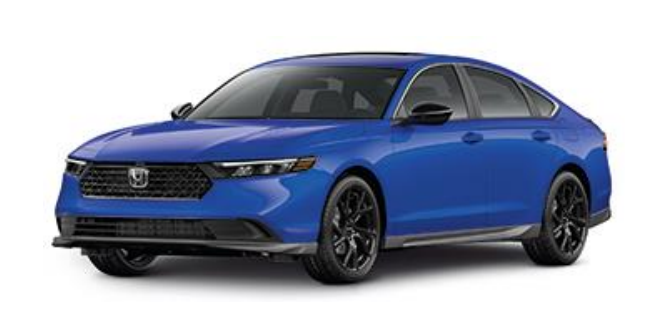
Aero Kit - Touring Trim $ 2,826.00 $12.89 /wk * (6.99%)

Genuine Honda Accessories purchased with a new Honda vehicle include a 3 year / 60,000 km manufacturer's warranty. Vehicle accessories purchased after vehicle sale include a 1 year / 20,000km manufacturer's warranty. *Prices shown include the cost of installation.