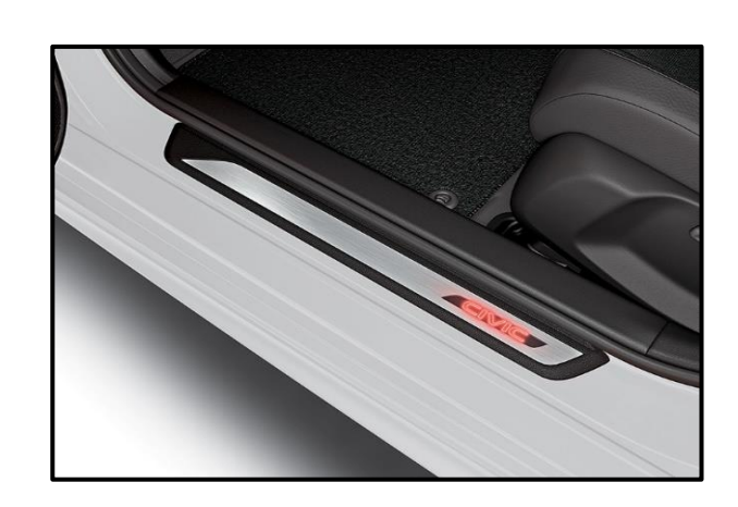
| Illuminated Door Sill Trim | $ 547 $2.49 /wk * (2.99%)