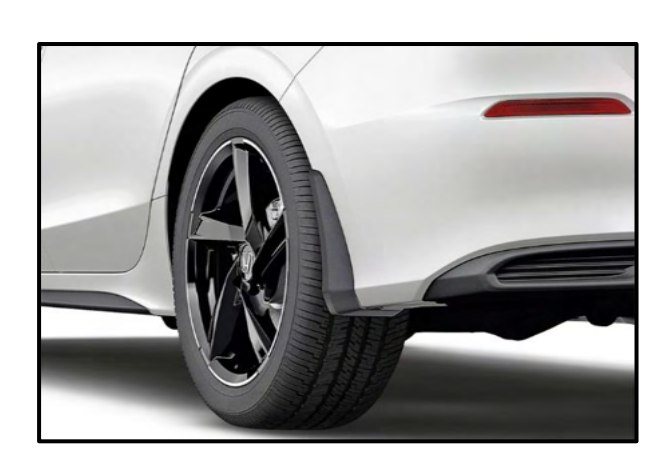
$ 152 $0.69 /wk * (2.99%)