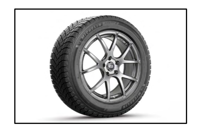
16" Enkei M52 Wheels & Michelin X-ICE Snow Tire Package $ 2,091 $9.54 /wk * (2.99%)

Genuine Honda Accessories purchased with a new Honda vehicle include a 3 year / 60,000 km manufacturer's warranty. Vehicle accessories purchased after vehicle sale include a 1 year / 20,000km manufacturer's warranty. *Prices shown include the cost of installation.