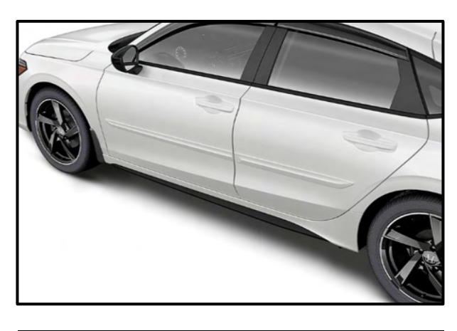
Body Side Molding $ 377 $1.72 /wk * (2.99%)