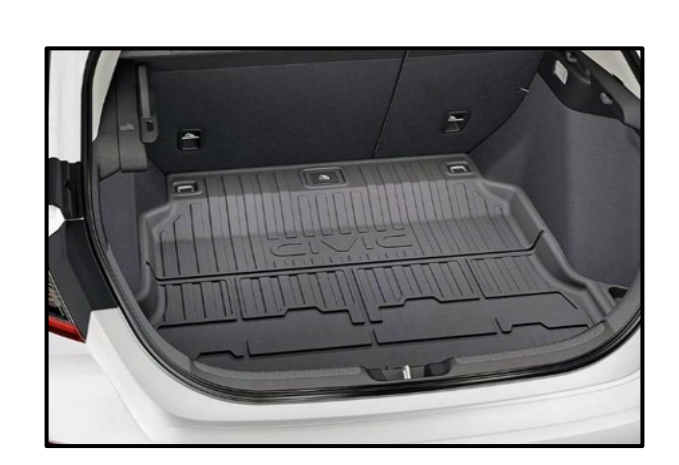
Cargo Tray $ 191 $0.87 /wk * (2.99%)