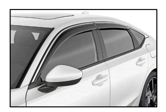
Door Visors $ 378 $1.72 /wk * (2.99%)